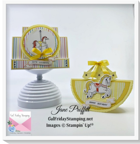
CARD # 1

Jayne2216@yahoo.com https://galfridaystamping.net